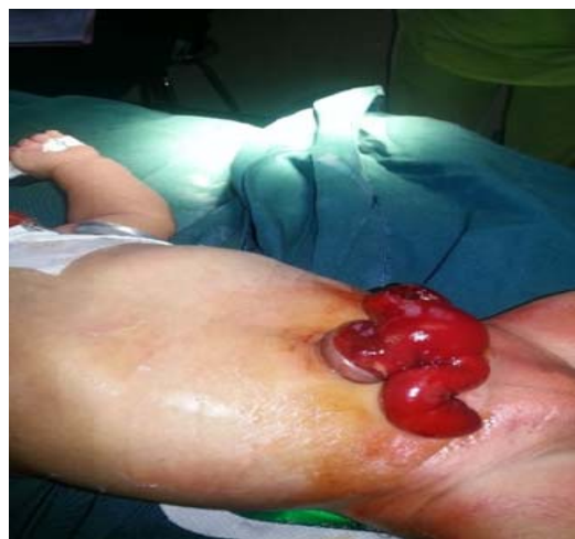
Fig. 1. Prolapsed ileum (T-shaped)

Abdominal examination revealed fleshy pink mass protruding through the umbilical defect. There was a defect at the umbilical area measuring 3 cm in diameter. There was greenish discharge from the limbs of the protruding mass ( Fig.1 ). The anal canal is well-formed and patent.