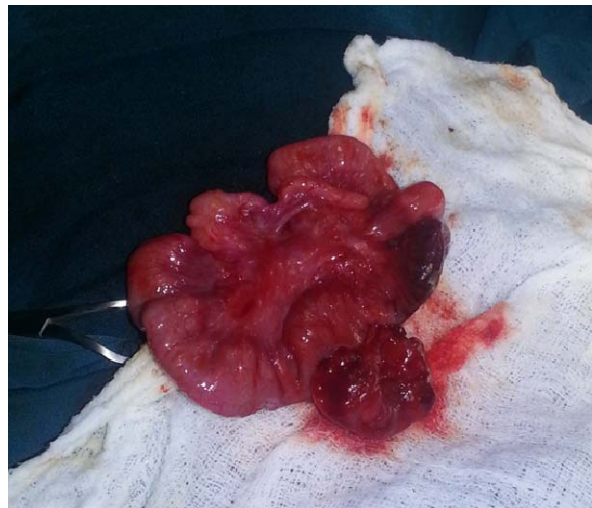
Fig. 4. Gangrenous ileal segment after reduction